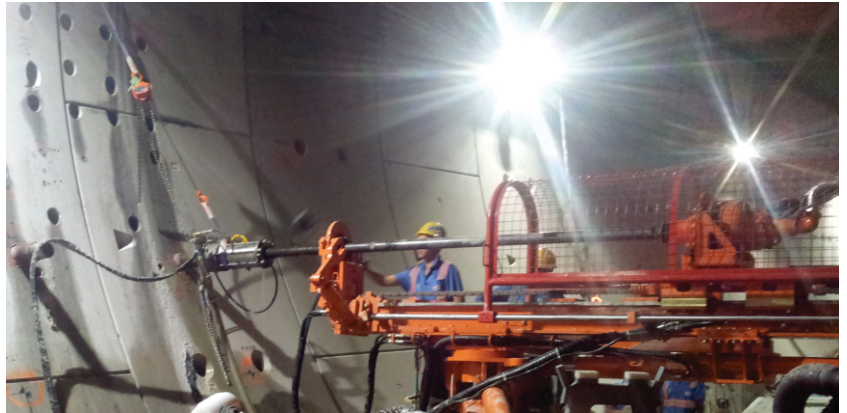
Sigra managed pressure drilling equipment installed for cross tunnel drilling and consolidation grouting. Lantang Tunnel, Hong Kong

Sigra has manufactured managed pressure drilling equipment since 1994 when it developed a system to drill into gassy coals and rock in coal mines. This was capable of operating at 7 MPa pressure. The key to the successful operation of this equipment was its elastomeric choke that permitted the passage of cuttings and fluid through it while maintaining a constant pressure within the borehole.