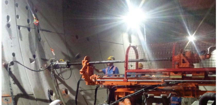
Sigra managed pressure drilling equipment installed for cross tunnel drilling and consolidation grouting. Lantang Tunnel, Hong Kong

Sigra has manufactured managed pressure drilling equipment since 1994 when it developed a system to drill into gassy coals and rock in coal mines. This was capable of operating at 7 MPa pressure. The key to the successful operation of this equipment was its elastomeric choke that permitted the passage of cuttings and fluid through it while maintaining a constant pressure within the borehole.